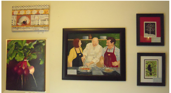
Looks great, guys!