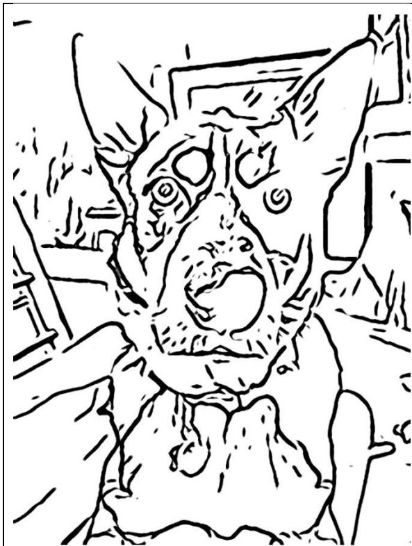
VIXA-the problem grand dog