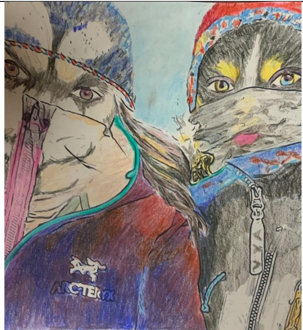
The daughters transformed