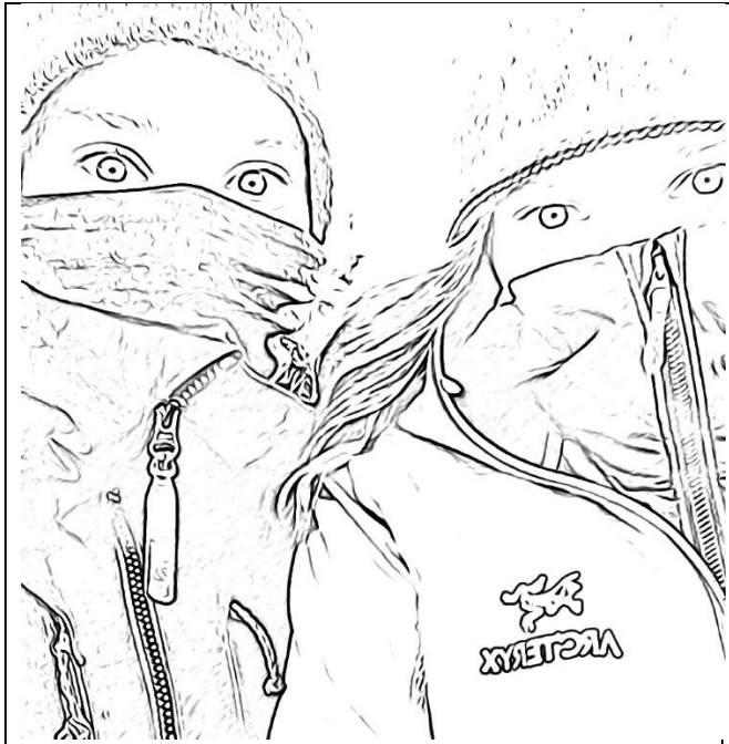
The naughty daughters